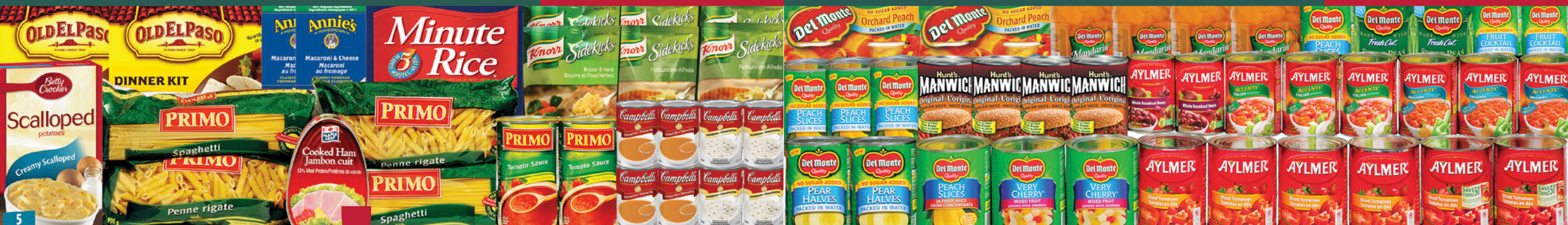
T: $171 00 | $3 29 PW